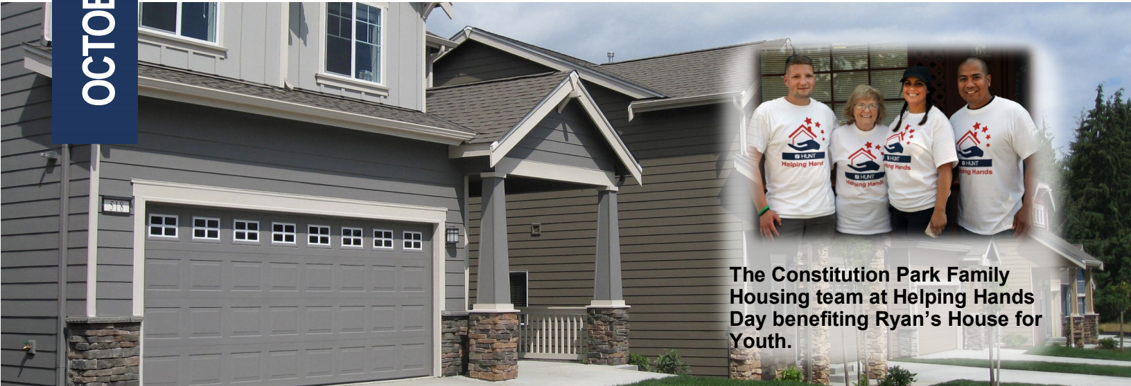
The Constitution Park Family Housing team at Helping Hands Day benefiting Ryan's House for Youth.