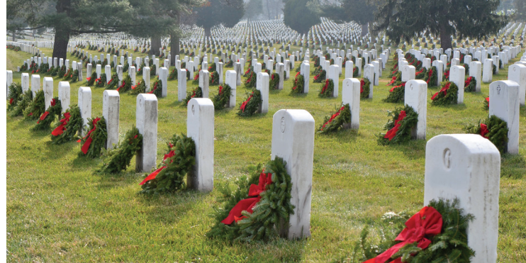
WREATHS ACROSS AMERICA DAY - DECEMBER 17TH