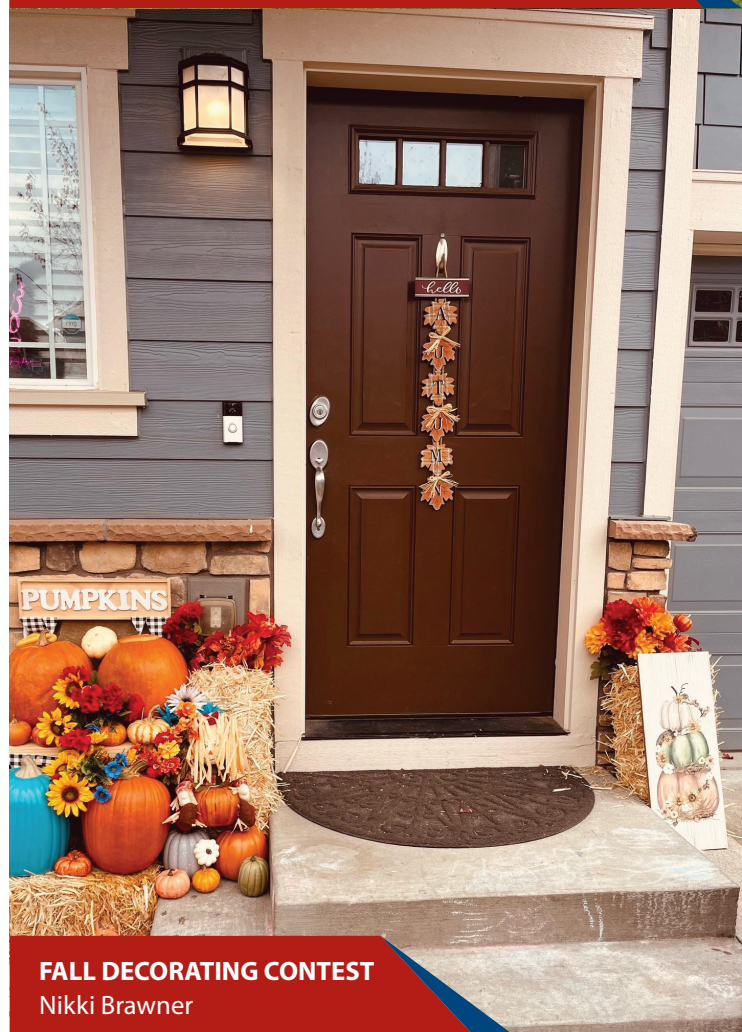
FALL DECORATING CONTEST Nikki Brawner