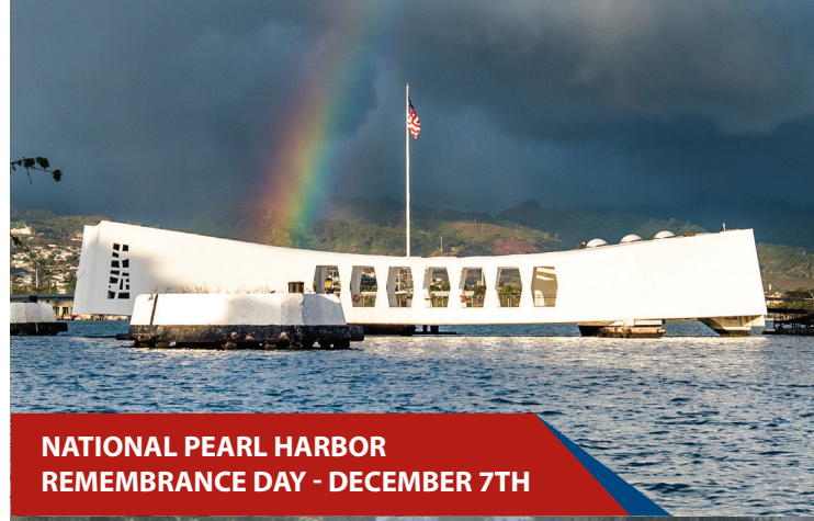
NATIONAL PEARL HARBOR REMEMBRANCE DAY - DECEMBER 7TH