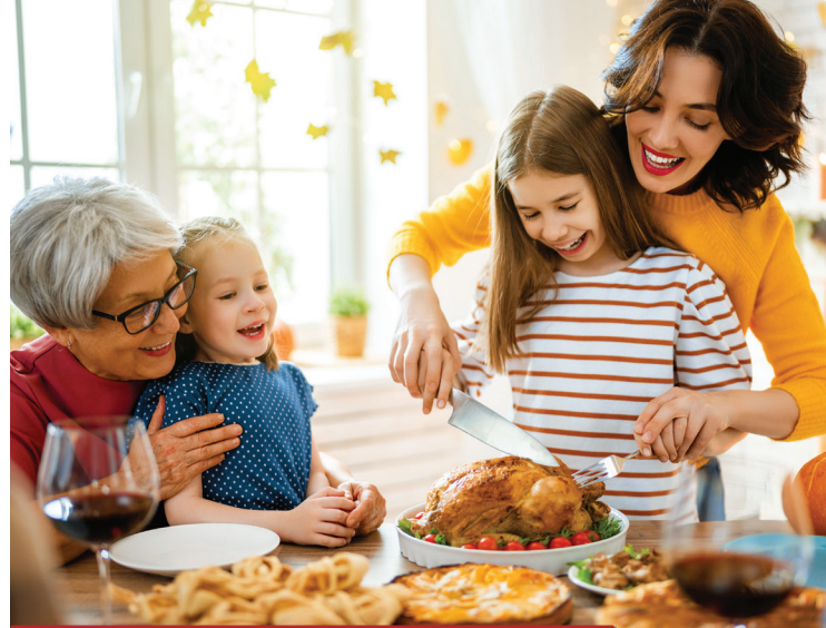
THANKSGIVING - NOVEMBER 23RD

Join us for our Community Advisory Board Meeting with the Community Director on November 29th, from 5:00 PM - 6:00 PM at the Community Center.