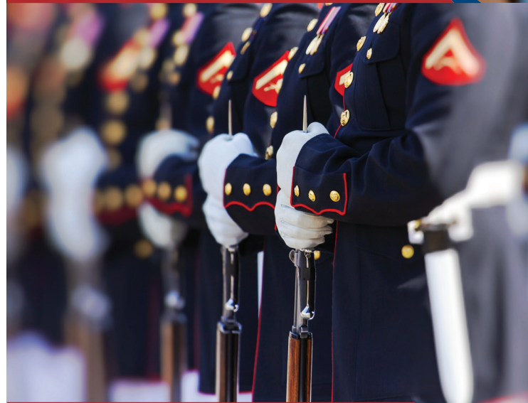
MARINE CORPS BIRTHDAY - NOVEMBER 11TH