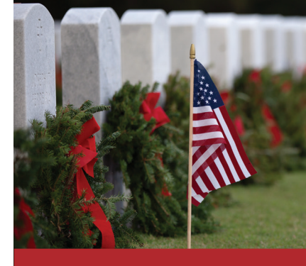
WREATHS ACROSS AMERICA - DECEMBER 16TH